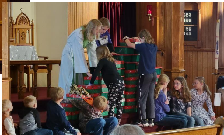
Blessing the boxes for their recipients