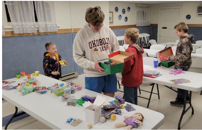
Packing the boxes