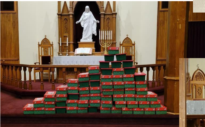
65 filled boxes!!