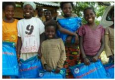
Mosquito nets for a family